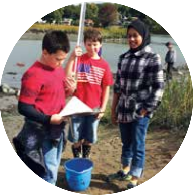
Students participating in RL6