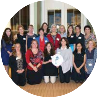
MRWC Board and 50th Anniversary Planning Committee