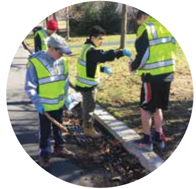
Boy Scouts install culvert reminders and promote education about the impact of runoff for an Eagle project in Lake Hills.