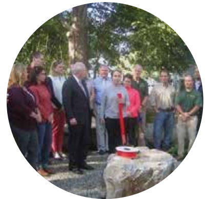
Dedication of Rockland/Wilson Road native plant garden established in conjunction with the Fairfield Board of Realtors and Sleepy Hollow Landscaping.