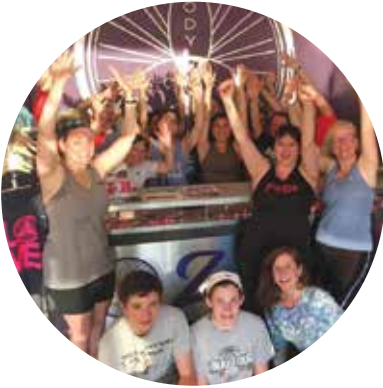
Zen Ride "Sweat for the Wetlands" fundraising event for MRWC