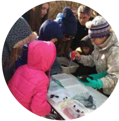
Overwintering Walk on Martin Luther King Day Holiday