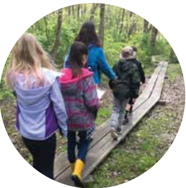
Students participating in RL5