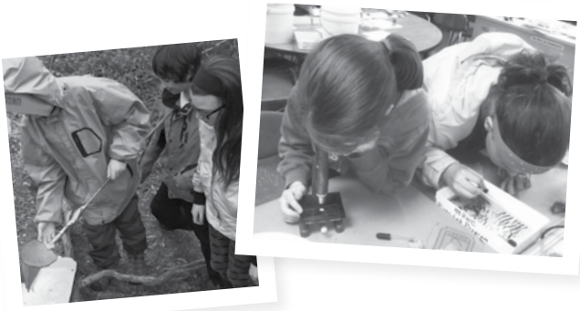
Grade 5 students putting their plankton sample in the pan to bring back to the classroom and “catching” and observing plankton in their water sample