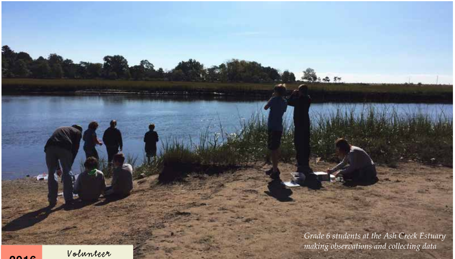
Grade 6 students at the Ash Creek Estuary making observations and collecting data